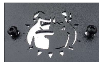
Figure 6: Side Panel Logo