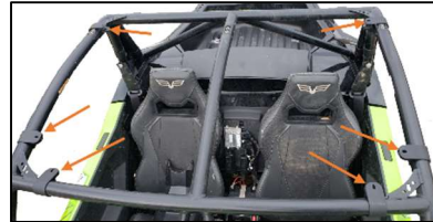
Figure 3: Roof Clamp Locations