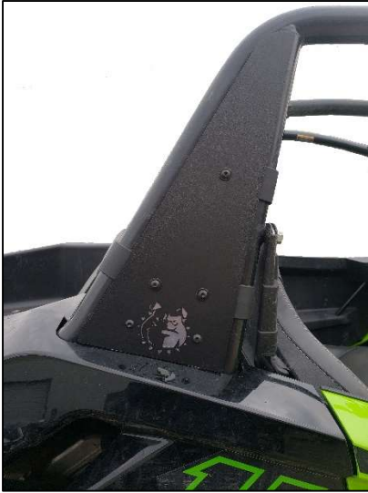
Figure 7: Mounted Side Panel