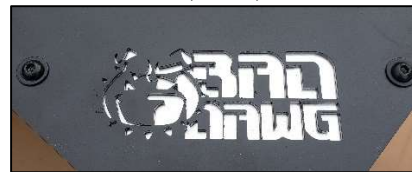
Figure 4: Roof Logo