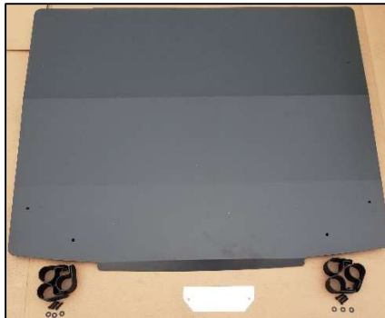
Figure 1: Kit Contents 1