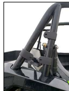
Figure 5: Side Panel Clamps Passenger Side