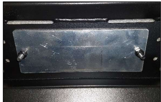
Figure 5: Accent Plate Inside the Bumper