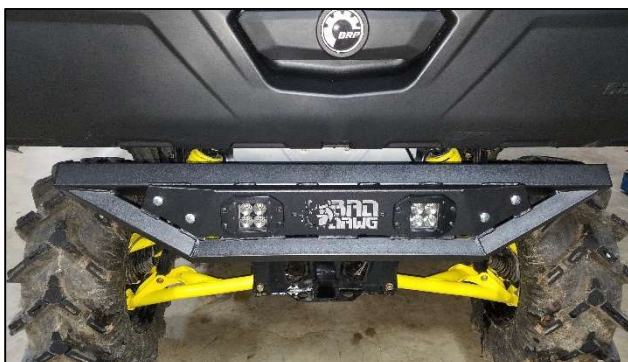
Figure 9: Bumper with Lights