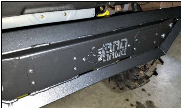
Figure 8: Light Hole Covers