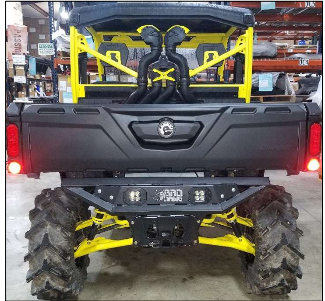
Figure 10: Installation Complete