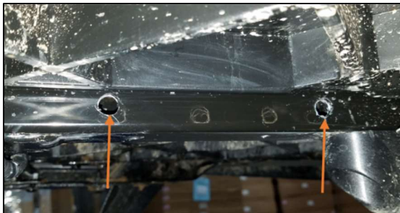
Figure 2: Drilled Out Bed Frame Holes