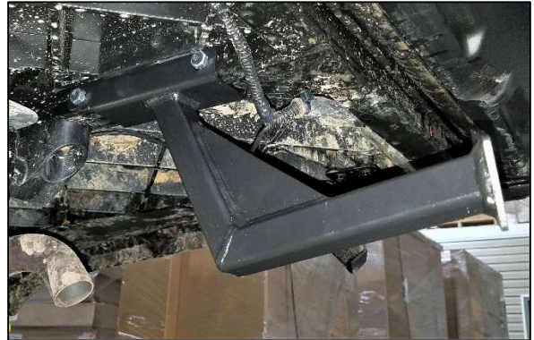
Figure 3: Right Side Mounting Bracket