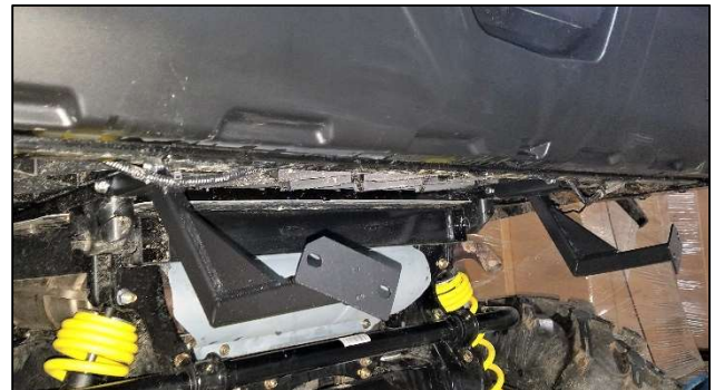
Figure 4: Mounting Brackets