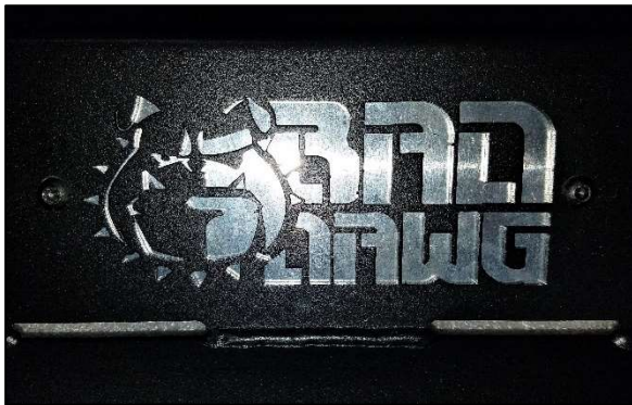
Figure 6: Accent Plate Outside Bumper