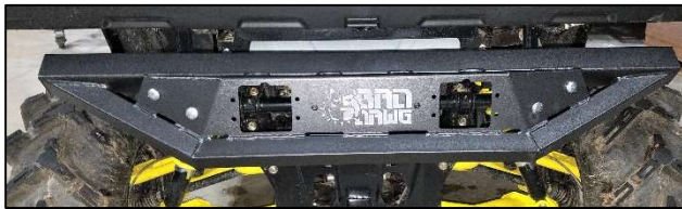
Figure 7: Bumper Mounted on Brackets