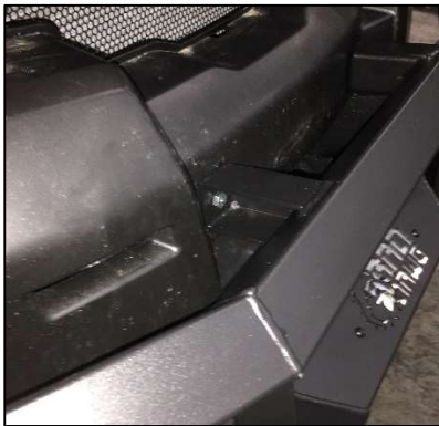
Figure 9: Bumper Mounting Location