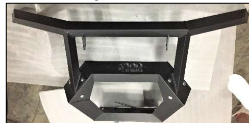
Figure 5: Bumper Mounted to Skid Plate