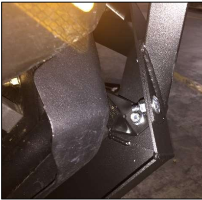
Figure 8: Right Mounting Bracket