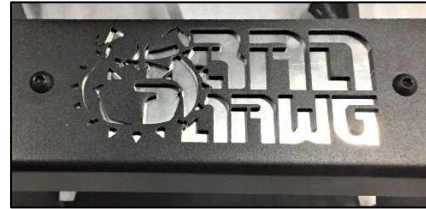
Figure 3: Mounted Accent Plate