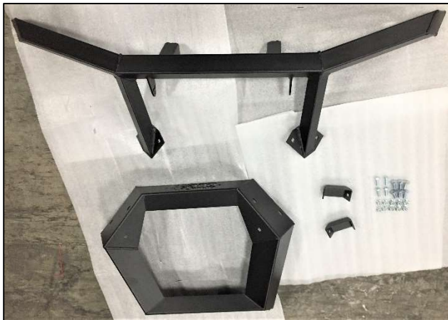
Figure 1: Kit Contents 1