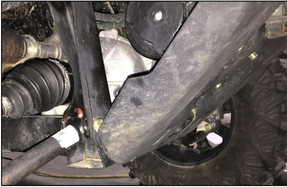
Figure 7: Factory Skid Plate