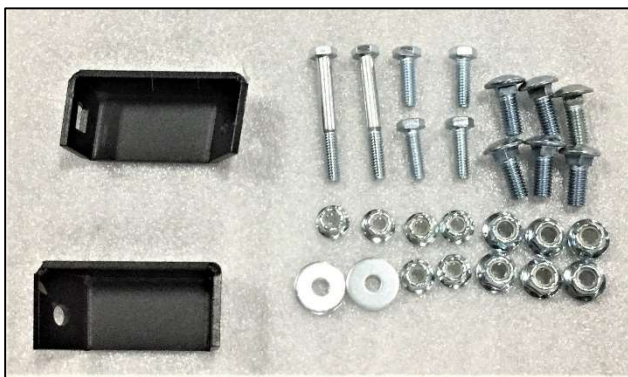
Figure 2: Kit Contents 2