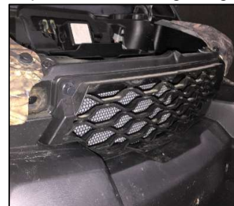
Figure 6: Plastic Grill Guard