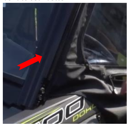
TIP: Front corner of upper door can be bent to seal better