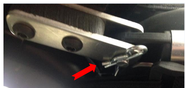
10) Align Brackets on Door Frame to holes on the lower door.