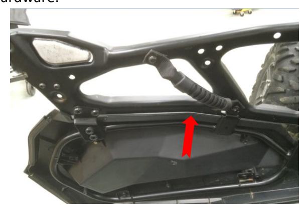
Tip: While door is uninstalled open window

6) Install molded handle with provided hardware.