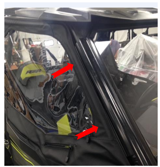
TIP: The OEM door may need to be adjusted forward and backward to create a seal on the ROPS, ensure the front triangle creates a good seal.