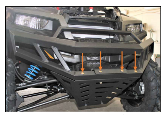
Figure 8: Bumper Mounting Hardware

7. Attach the face of the bumper to the skid plate and the winch plate. This will bring all of the parts of the bumper together.