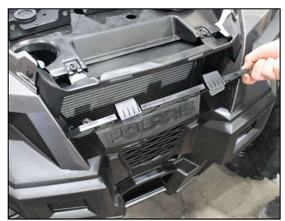
Figure 3: Top Grille Removal

3. Attach the winch plate mounts to the machine using the factory bumper mounting holes using the factory hardware retained in step 1.