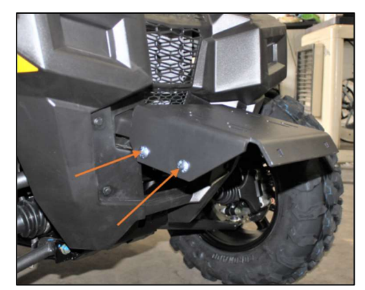
Figure 5: Winch Plate Mounting Hardware

4. Attach the winch plate to the winch bracket mounts.