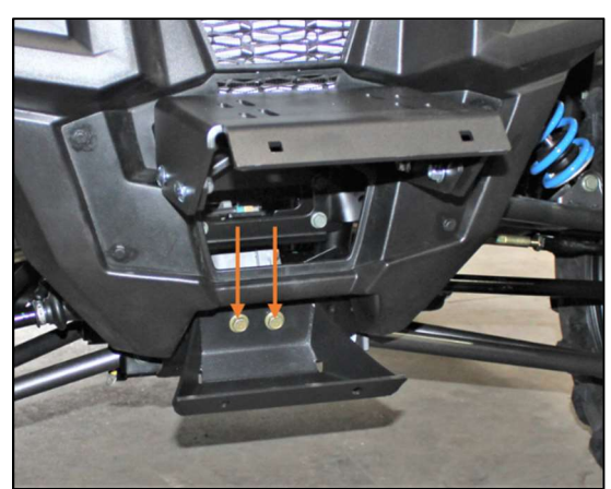
Figure 6: Lower Skid Plate Mounting Hardware

5. Attach the bottom skid plate to the lower mounting holes.