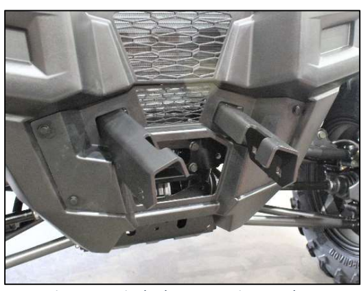
Figure 4: Winch Plate Mounting Brackets

3. Attach the winch plate mounts to the machine using the factory bumper mounting holes using the factory hardware retained in step 1.