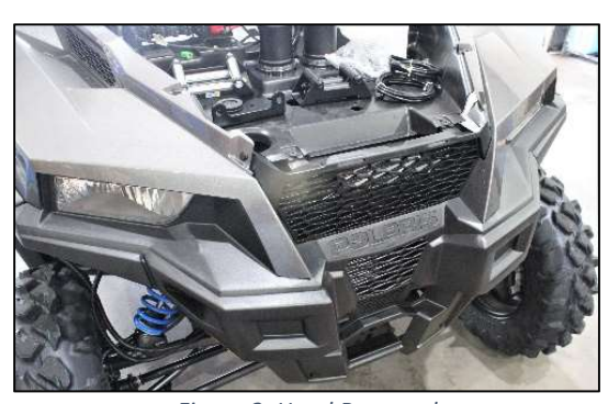
Figure 2: Hood Removed

2. Remove the hood and upper grill insert.