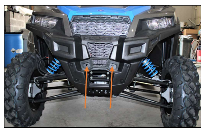
Figure 1: Factory Mounting Locations

1. Remove factory bumper (if equipped) and retain the factory hardware for later use. If the machine is not equipped with a factory bumper, utilize the hardware provided in the hardware kit to complete the installation.