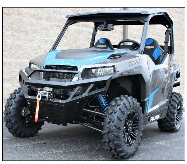
Figure 9: Installation Complete

8. Once the entire assembly is in place, tighten all hardware securely.