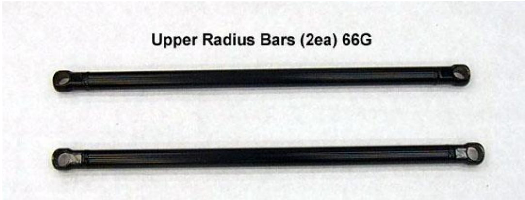
Upper Radius Bars (2ea) 66G