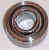
Spherical Bearing (4ea) 68Y