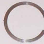
Retaining Ring (8ea) 68Z